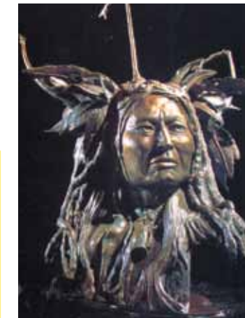
Ralph Crawford, Rain in the Face (showing at 1)

Sisters Cookie Company - Cookies & Lemonade - 5-9pm MELA - Indian Food & Drinks - 5-9pm PRLR - Pizza - 5-9pm Sticky Fingers Farm - Ice Cream - 5-9pm Grub Wandering Kitchen - Mac & Cheese, Tacos, BBQ Quesadillas, Curry - 5-9pm Brush Creek Brick Oven Pizza - Brick Oven Pizza, Tea, and Lemonade - 5-9pm