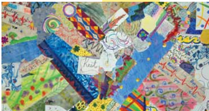
Spectrum II, Heart Community Collage, Wellness Through Art project (showing at 46)