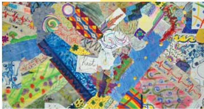
Spectrum II, Heart Community Collage, Wellness Through Art project (showing at 46)