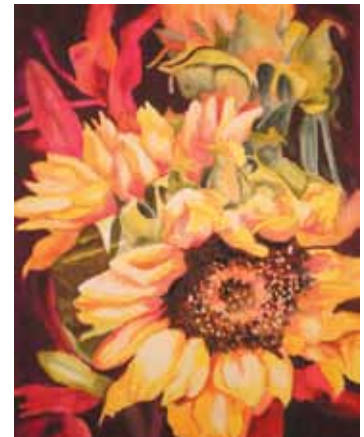
Gabriella Ball, Sunflowers (showing at 32)