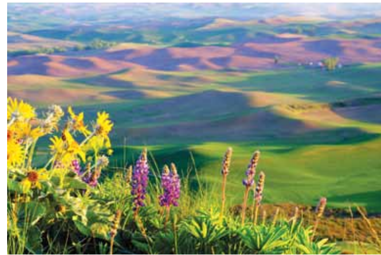
Ken Carper, Wildflowers on Steptoe Butte (showing at 65)