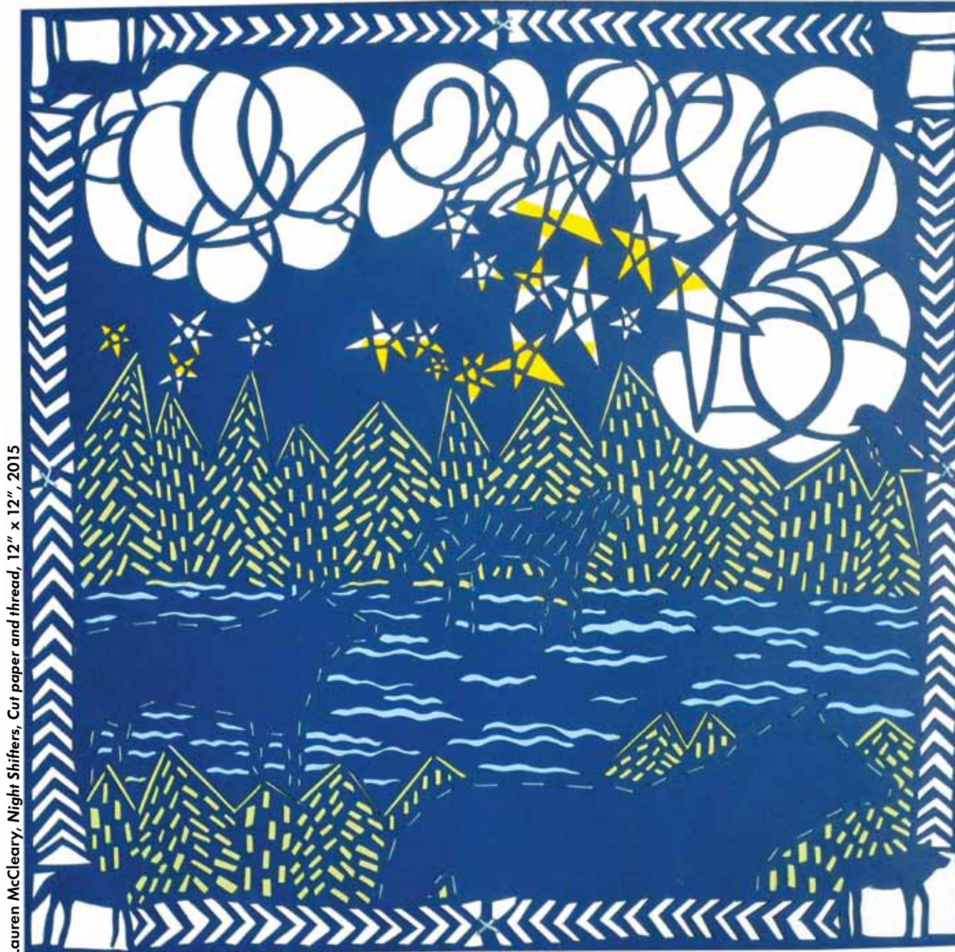
Lauren McCleary, Night Shifters , Cut paper and thread, 12" x 12", 2015