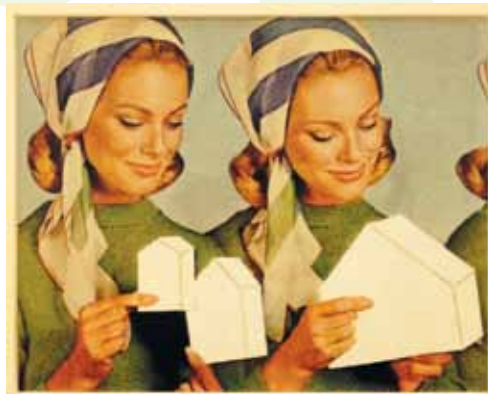
Nara Woodland, Transparency and Accommodations (showing at 44)