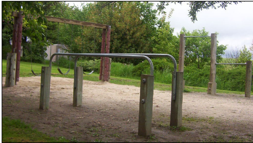
Old Playground vs. New Playground