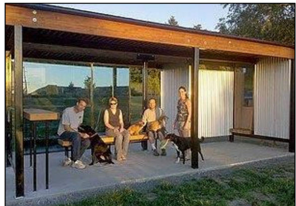
Moscow Dog Park Shelter