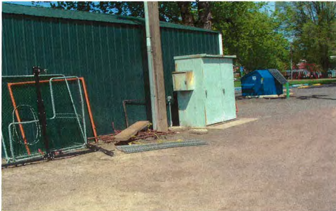
Side of building