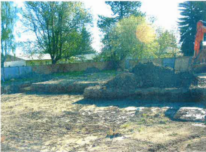
• East side yard