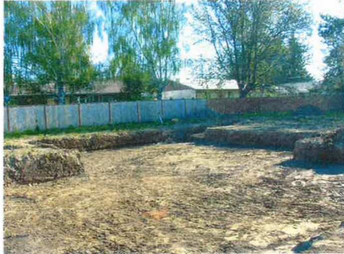
• North East Back yard

If using the Elevation Certificate to obtain NFIP flood insurance, affix at least 2 building photographs below according to the instructions for Item A6. Identify all photographs with date taken; "Front View" and "Rear View"; and, if required, "Right Side View" and "Left Side View." When applicable, photographs must show the foundation with representative examples of the flood openings or vents, as indicated in Section A8. If submitting more photographs than will fit on this page, use the Continuation Page.