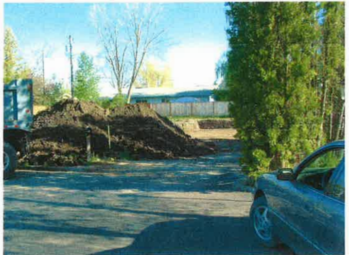
• South entrance to the property