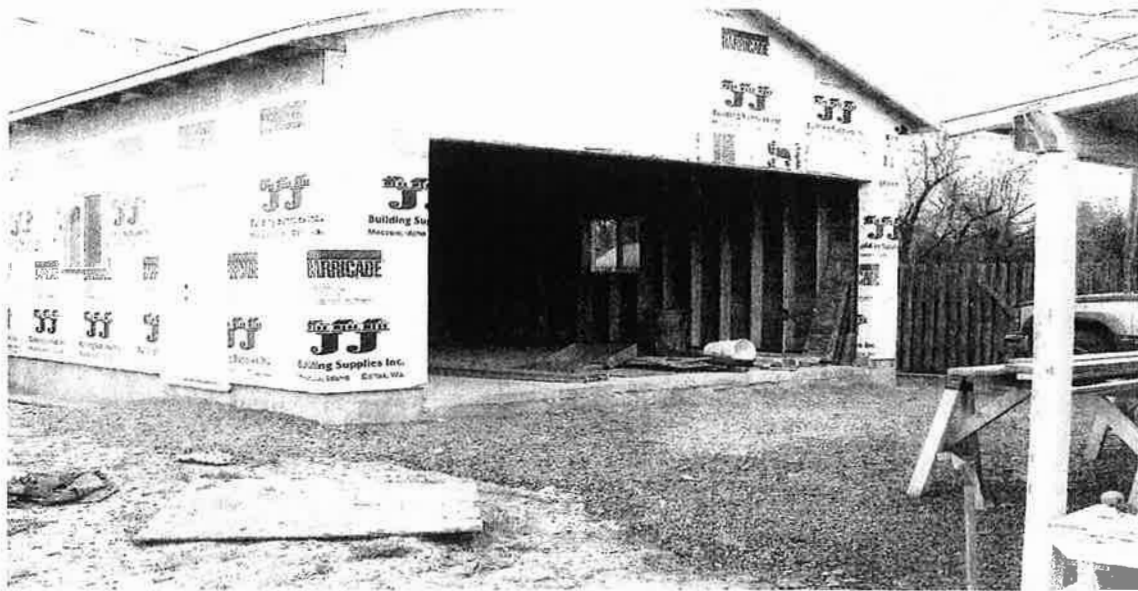
FRONT VIEW Picture Taken 4-18-08

If using the Elevation Certificate to obtain NFIP flood insurance, affix at least two building photographs below according to the instructions for Item A6. Identify all photographs with: date taken; "Front View" and "Rear View"; and, if required, "Right Side View" and "Left Side View." If submitting more photographs than will fit on this page, use the Continuation Page, following.