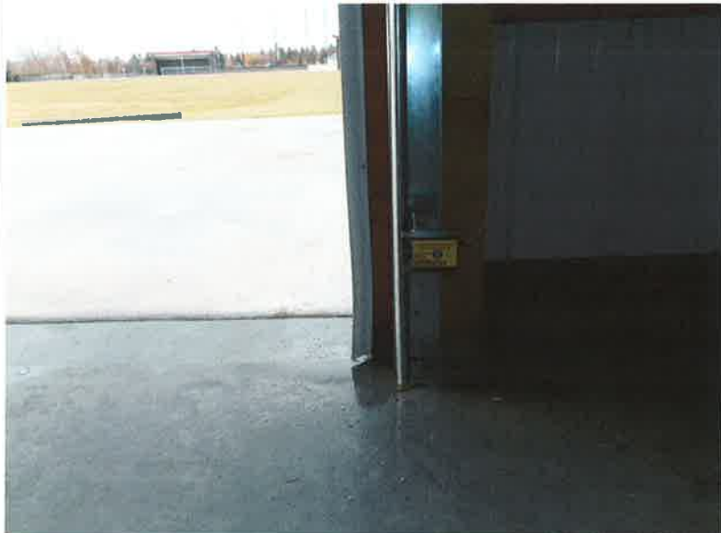
Garage door sensor. Lowest equipment in building