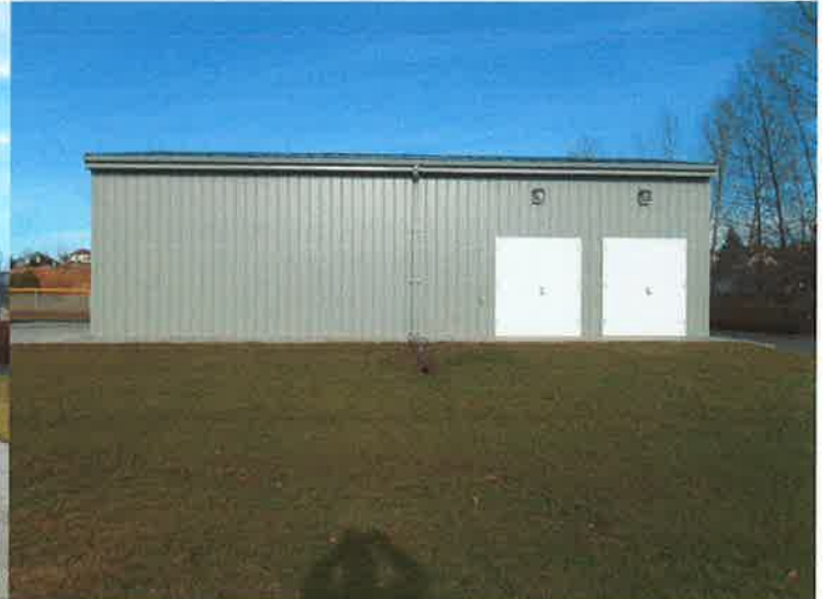
Southside storage shed with access to two storage closet's.