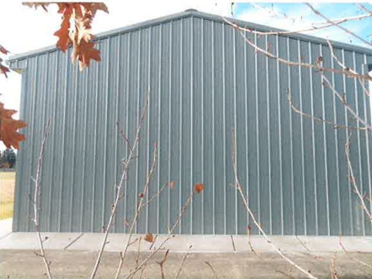
Eastside storage unit, no building access.