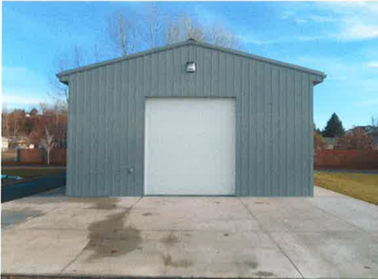
Westside storage shed garage access. Pictures taken 12/08/2014

If using the Elevation Certificate to obtain NFIP flood insurance, affix at least 2 building photographs below according to the instructions for Item A6. Identify all photographs with date taken; "Front View" and "Rear View"; and, if required, "Right Side View" and "Left Side View." When applicable, photographs must show the foundation with representative examples of the flood openings or vents, as indicated in Section A8. If submitting more photographs than will fit on this page, use the Continuation Page.