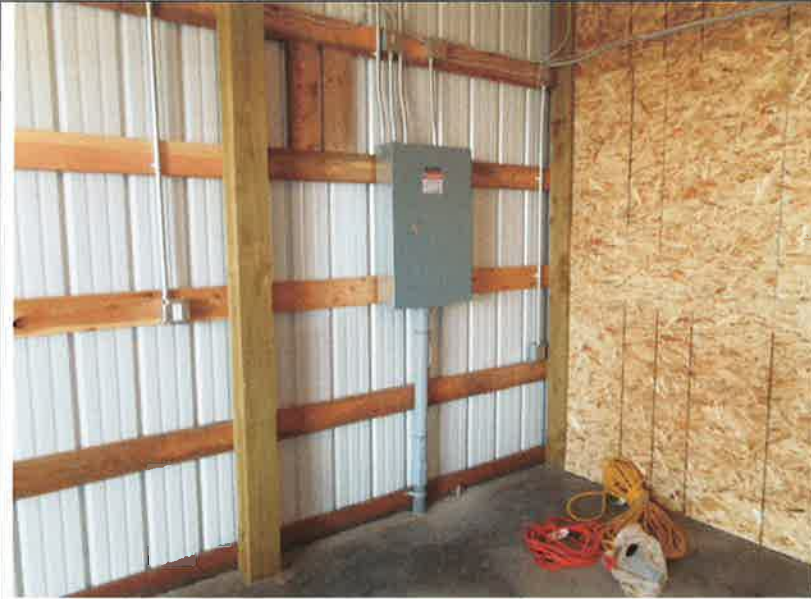
Electrical panel on north wall in northeast corner of garage.

If submitting more photographs than will fit on the preceding page, affix the additional photographs below. Identify all photographs with: date taken; "Front View" and "Rear View"; and, if required, "Right Side View" and "Left Side View." When applicable, photographs must show the foundation with representative examples of the flood openings or vents, as indicated in Section A8.