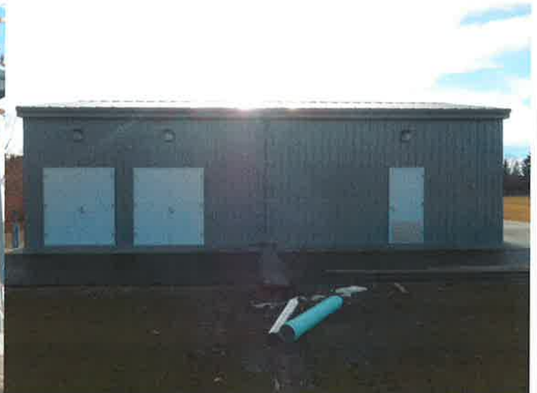
Northside of storage building with access to two storage closet's and garage access.